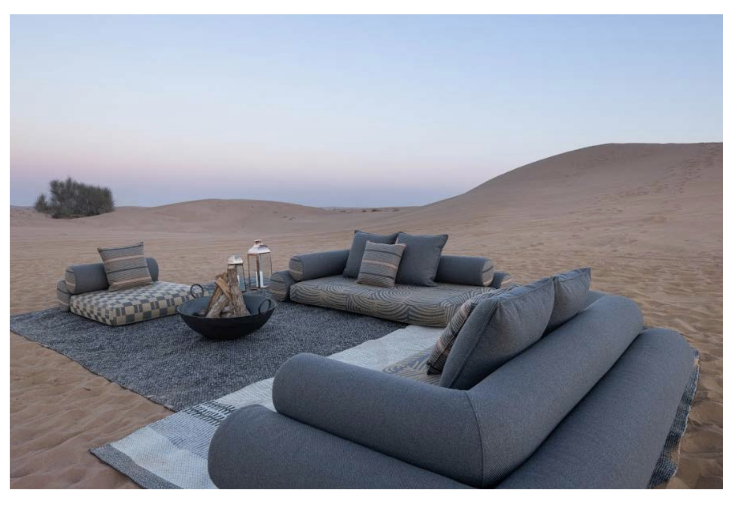
JWANA HAMDAN/MAJLIS ON FLOOR/THE WANDERING MAJLIS COLLECTION

They've been hard to ignore. From Pinterest boards to Instagram posts of the coolest interiors captioned #interiorgoals, us too have fallen for the intentional – or not – propaganda of wavy designs, curved angles -minimalistic in their approach yet bold in their execution- pieces of furniture that were spotted left and right at this year's Downtown Design.